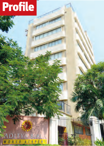
Aditya Birla World Academy at Tardeo